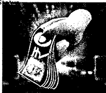
Know Your Payments